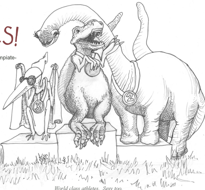
World class athletes. Sexy too.